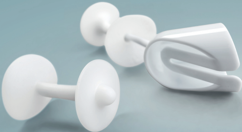
Renew Inserts with inserter