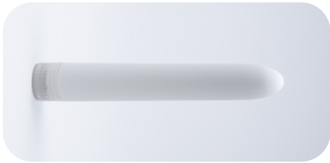
Slimline Vibrating Dilator