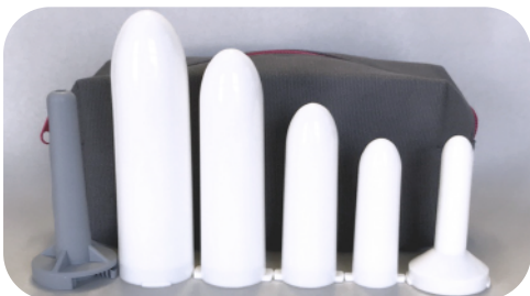
Amielle Dilator Set