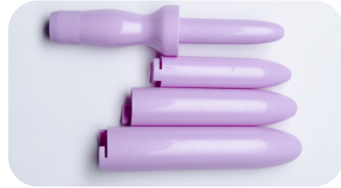
Berman Vibrating Dilators