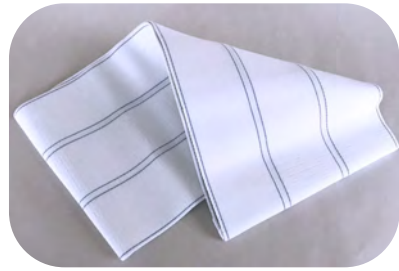
MediChoice Abdominal Binder