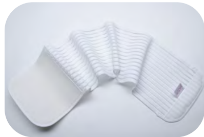
Loving Comfort Postpartum Support