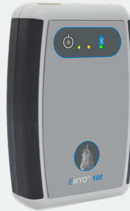
EMYO® 100 Single Channel EMG