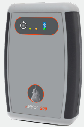
EMYO® 200 Dual Channel EMG